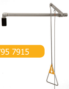
Body shower, wall mounted

Pressure: 2,4-7 bar Flow: 76 lit/min Connection: DN20 Ball valve: Stainless 1.4404 Douche: Plastic Acetal