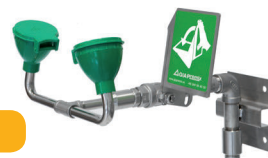
Eye-/face shower, wall mounted

Pressure: 2,4-7 bar Flow: 20 lit/min Connection: DN15 Ball valve: Stainless 1.4404