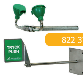
Eye-/face shower, freeze resistant mounted valve

Pressure: 2,4-7 bar Flow: 26 lit/min Connection: DN15 Ball valve: Stainless 1.4404