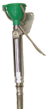
Hand shower, wall mounted, hose 2 m

Pressure: 2,4-7 bar Flow: 20 lit/min Connection: DN15 Handle/Valve: Chrome brass