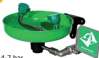
Eye shower, wall mounted

Pressure: 2,4-7 bar Flow: 10 lit/min Connection: DN15 Ecoulement: DN32 Ball valve: Stainless 1.4404