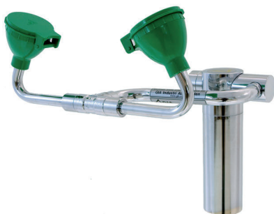
Eye-/face shower, mounted on table

Pressure: 2,4-7 bar Flow: 26 lit/min Connection: DN15